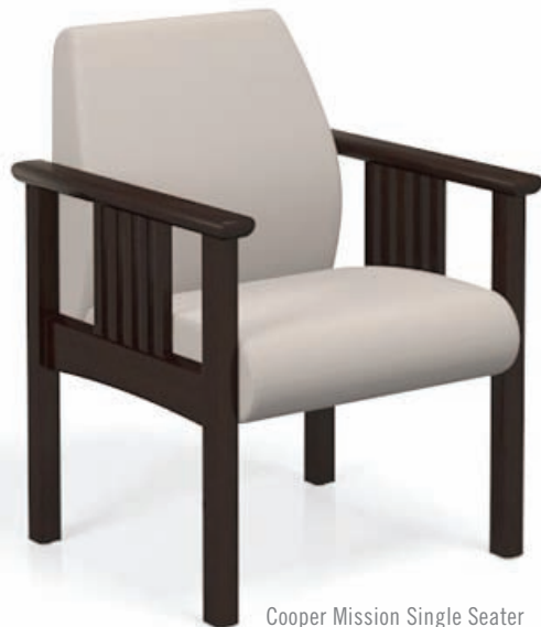
Cooper Mission Single Seater

*values based on a Mission single seater.