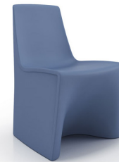
8701 23 lbs

seat H 18.0 seat W 19.0 total H 32.75 total W 20.0 depth 24.0